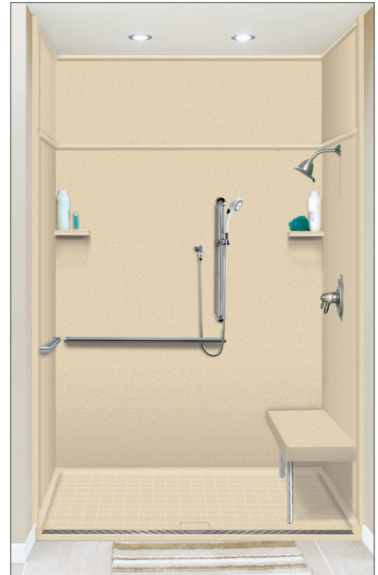
Shown with FG6338 Shower Base, X6382 Extension Wall Kit, GB3729PS Grab Bar Set, H2513 Shower Seat, GBHS18PS Hand Shower with 18" ADA grab bar.